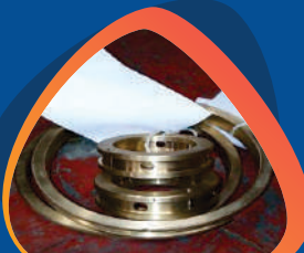
Lantern & wear ring