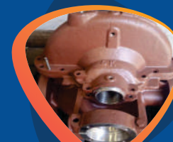
Horizontal split case pumps