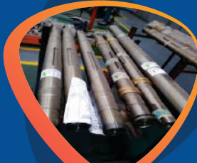
S/S & EN8 shafts