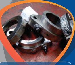
S/S gland & lock nuts