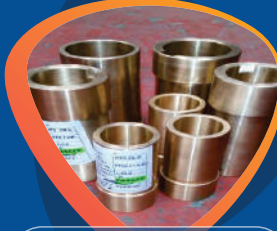
Bronze shaft sleeve