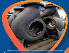
C/Iron pump casing