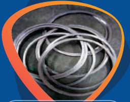
Spiral wound Gaskets