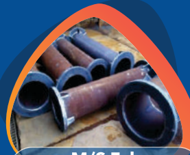
M/S Fab pump Column