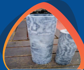
Tuffcot - bushes