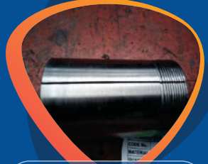
S/S Taper Sleeve