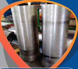
S/S shaft sleeve