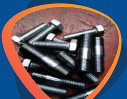
Bolts and Studs